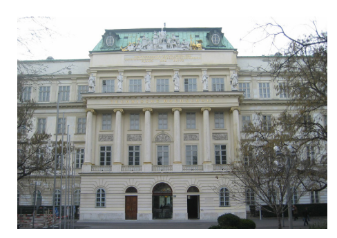
Vienna University of Technology

Besides common joint research projects, it has been the guest research stays of Ukrainian scientists to Vienna that set a particular course in the cooperation. Lecturers of Lvivska Polytechnika are given the opportunity to work on specific research projects that are associated with their immediate field of teaching or research. This is, in most cases, linked to an academic goal such as a habilitation(?) or dissertation.